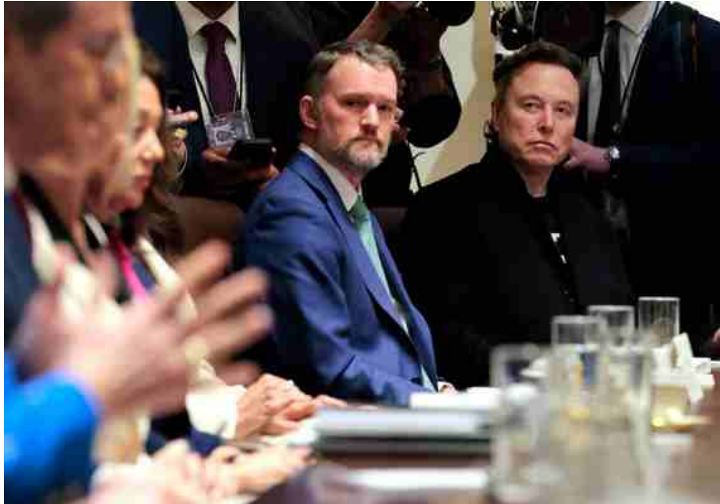
Elon Musk during a Cabinet meeting at the White House.

In the DOGE era, even missives that might have otherwise seemed positive can have a malevolent undertone.